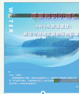
AWS Water Management Advocacy Post