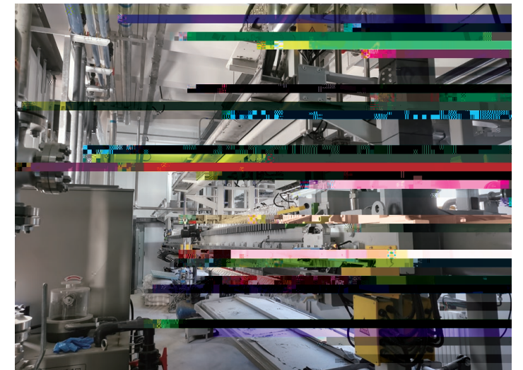
Wastewater Treatment Station

In order to effectively reduce the use of fresh water and improve the efficiency of water recycling, Luxis Dezhou has carried out an organic wastewater recycling project. After the organic wastewater is collected, it is sent to the biochemical treatment facility for treatment by sand filtration, activated carbon filtration, RO reverse osmosis and other devices. The recycled water that meets the requirements is used for cooling tower makeup water.