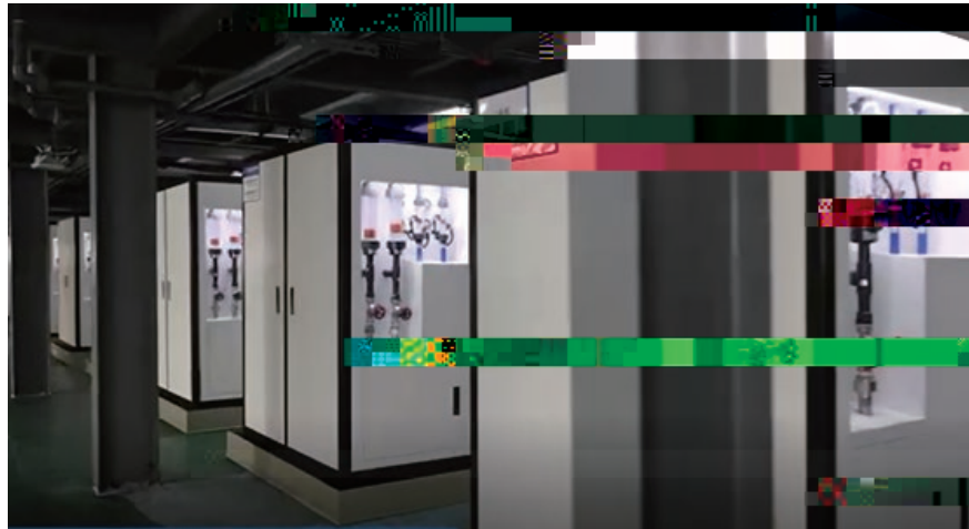
Luxcase ICT Yancheng's Online Water Recycling and Treatment Equipment

We are constantly upgrading our wastewater recycling and treatment systems to increase the reuse rate of wastewater while strengthening the system's treatment capacity. In addition, we strengthen our wastewater management by enhancing equipment and piping inspections to prevent leaks.